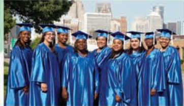
Graduates of MEP's Women's GED program

The 2013 Side-by-Side Golf Outing will benefit Mercy Education Project (MEP) located in southwest Detroit. MEP provides educational and life skills support to girls and women seeking to improve their lives.